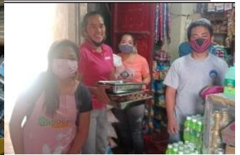
Ifugao Transport Service Cooperative (formerly IBJODA) preparing at the Lagawe Terminal over 100 sacks of 25 kilos rice for distribution to their drivers, operators and employees.

Galatians 6:2 "Carry each other's burdens, and in this way you will fulfill the law of Christ."