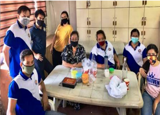
CDA Skeletal Force

Historically, IPs have been subject of discrimination and marginalization from political processes and economic benefit. In this pandemic, the IPs may again face a degree of exclusion in accessing assistance from the mainstream of support services. With this in mind, two cooperatives in the region took the initiative to help the IPs by sharing their resources for their membership and the community. These cooperatives believe that if basic services and socio-economic opportunities are made more accessible to IPs, they can certainly attain the improvement they deserve in the context of sustainable development.