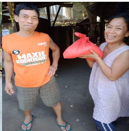
Co-ops for Christ Misamis Oriental giving relief goods to the community