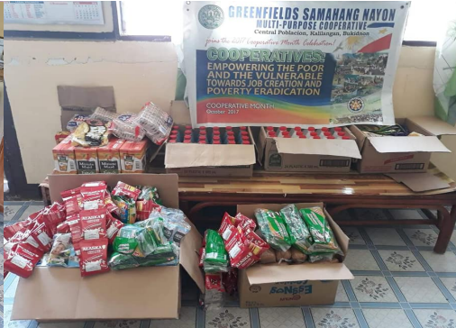
Greenfields MPC in Kalilangan, Bukidnon giving of relief goods to members.