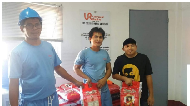
Rice assistance given by URC El Salvador Employees MPC to its members during Covid 19 Crisis