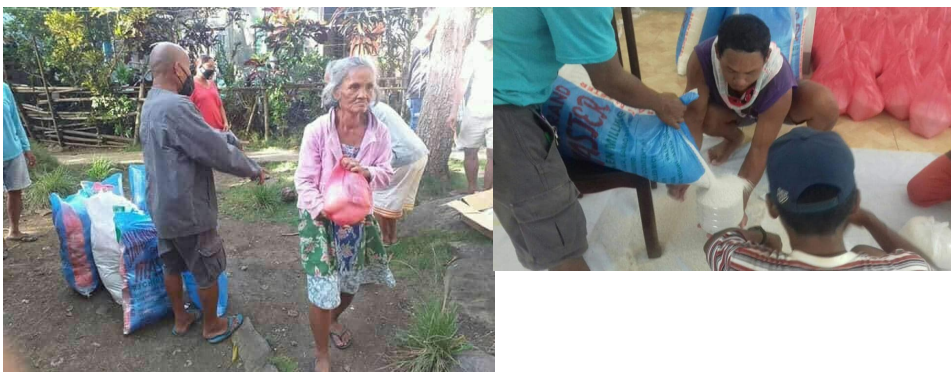
Simbuco Aqua-Marine Multi-purpose Cooperative in Brgy. Simbuco Kolambugan, Lanao del Norte distributed relief in the barangay