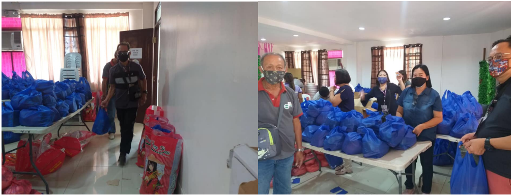
Provincial Capitol Employees Cooperative or PCEMCO, distributed food packs to its members