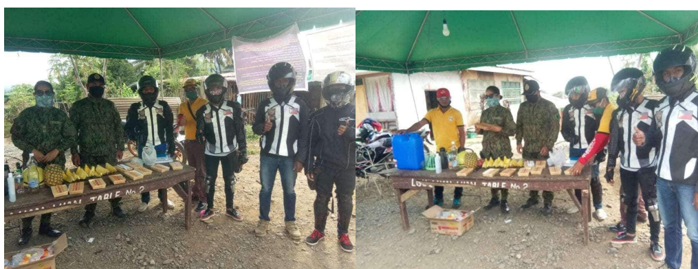
Busco Academy MPC in Quezon, Bukidnon gave food packs to the frontliners in the area.