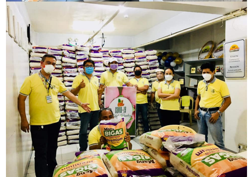
DMPI-ECCC COVID-19 RELIEF HANDOG