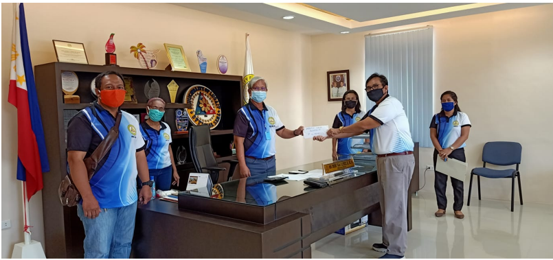
Lugait Municipal Employees Multipurpose Cooperative (LMEMPCO) donated cash P30,000.00 to LGU for its COVID-19 response.