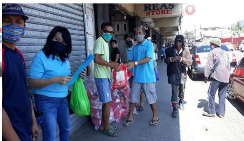
Bagong Iligan Transport Service Coop (taxi drivers) the officers gave 10 kilos of rice to all the drivers. April 13, 2020

Iligan City Cooperative Development Council (ICCDC) initiated an activity to fight against COVID 19 pandemic. All Small, Medium and Large coops in Iligan were encouraged to donate an amount from their CDF to raise funds. ICCDC distributed food packs to different coops in Iligan which have poorest of the poor members. There were 187 members from different coops were given. Coops for Christ - 26 families, Sm Woodcraft MPC - 28 families, Upper Hinaplanon Aggregates MPC- 48 families, Timoga MPC - 65 families, Sikyop Agriculture Coop 20 families.