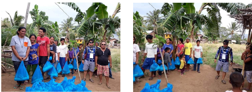
Alternative Concern and Support to Livelihood Multipurpose Cooperative (ACSL-MPC) in Sultan Naga Dimaporo, Lanao del Norte gave 41 food packs to poorest of the poor families of Ramain, SND.