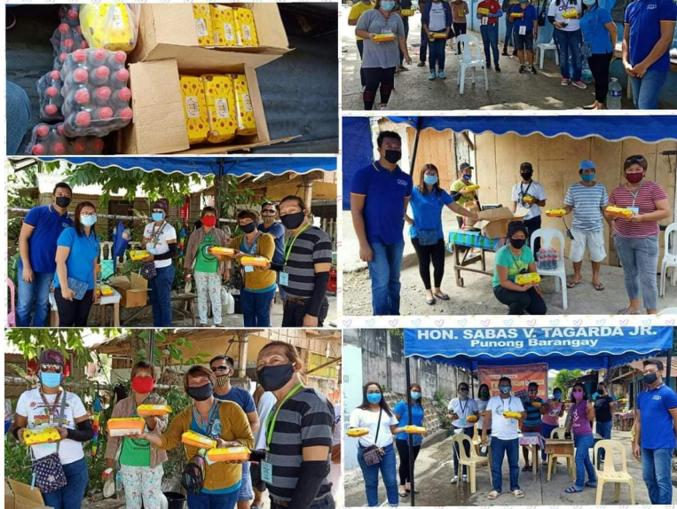
PEOPLES ELAN MPC of Jasaan gave snacks to the frontliners in the area.