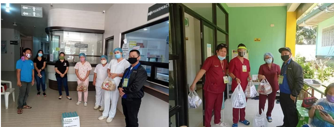
MSU-IIT Tubod Branch (Provided foods and supplies to the FRONTLINERS)