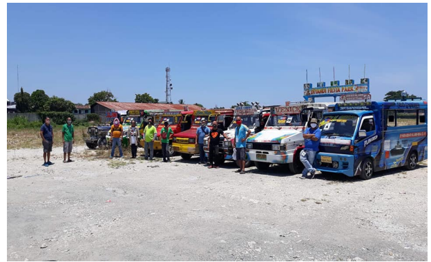
Northern Mindanao Federation of Transport Service Cooperative (NOMFEDTRASCO) volunteered 10 jeepneys for free to cater to the needs of the frontliners from their residence to the hospitals where they are working and vice-versa in Iligan City. The LGU provided gas worth Php 5000 for the