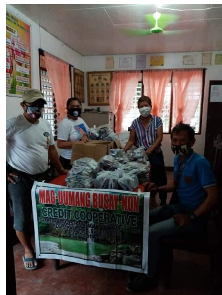
Mag-uumang Busaynon Credit Cooperative in Kapatagan, Lanao del Norte extended assistance to the 50 households in the area both members and non-members.