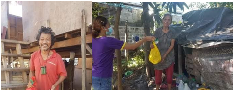
The Iligan Diagnostic and MPC gave financial assistance to 33 poorest of the poor families in Palao Iligan City.