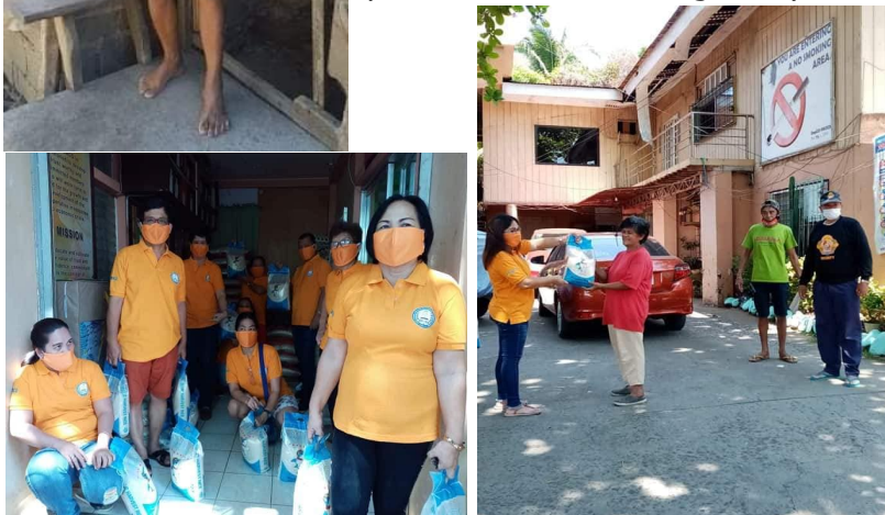
PETEMCO, Public Teachers Employees Cooperative in Ozamiz City community assistance during covid 19 crisis