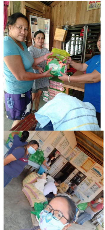
Tubaran Multi Purpose Cooperative, Tubaran, Tubod, Lanao del Norte