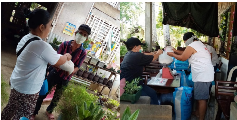
Pipin SN, Tubod, Lanao del Norte

Paglaum MPC @ Plaridel, Misamis Occidental extended assistance to the communities and members in the midst of COVID 19 pandemic. The Coop donated foods ,water, face shields, and alcohols to the armies, police and other frontliners in the province . Aside from ISC and PR, the coop distributed rice to the members as part of their GA benefits.The coop also observed social distancing measures. Paglaum Coop - "CARES OUR FRONTLINERS"