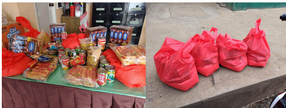
Valencia National High School MPC in Bukidnon provided food packs to their front liners and gave financial assistance to all their employees in the amount of P5,000.