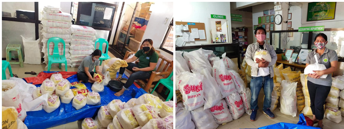
Diversified Multipurpose Cooperative in Valencia City, Bukidnon distributed 588 food packs for all their workers as assistance during the COVID 19 crisis.