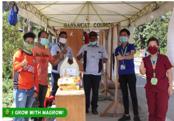
MAGROW MPC distributed goods to checkpoints frontliners