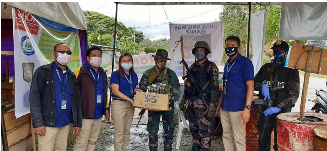
Pantukan Chess Club donated fresh fruits and mineral water to Task Force in Mati City

Pantukan Chess Club Cooperative donated fresh fruits and mineral water to Task Force, Tagawisan, Barangay Badas, Mati City, on March 24, 2020.