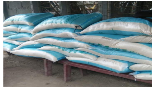
Rice distributed by PAWARB COOP to Barangay Osmena, Compostela, Davao del Oro

Frontliners of Barangay Osmena, Compostela, Davao de Oro received groceries from DFC Multipurpose Cooperative on April 14, 2020.