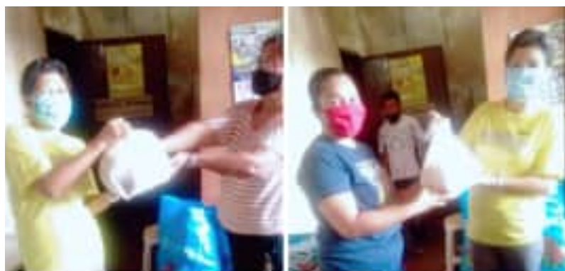
SAFASHCO MPC distributed goods to community

SAFASHCO Multi Purpose Cooperative (SAFASCHO MPC) located in Mati, Davao Oriental, provided relief goods to their members and community on April 08, 2020.