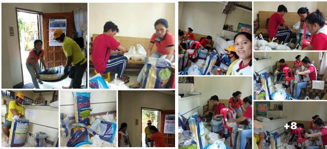
CASMI Cooperative distributed goods to pedicab drivers

In April, 2020, Casig-ang San Miguel Multipurpose Cooperative (CASMI MPC) donated relief goods to the pedicab drivers in the community.