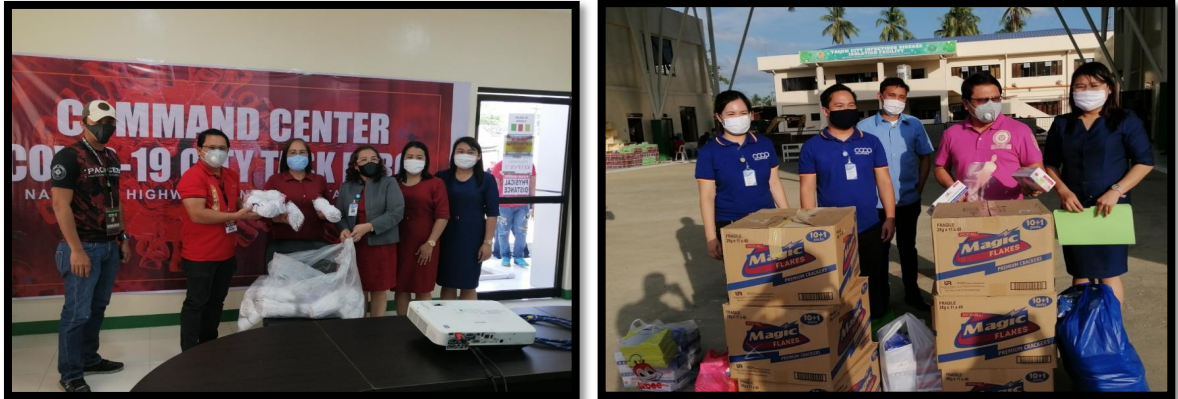
Tagum Cooperative donated food and medical supplies to frontliners through the City Government of Tagum

Furthermore, using its Community Development Fund, it donated face masks, disposable gloves and biscuits to the frontliners, through the City Government of Tagum on March 31 and April 3, 2020.