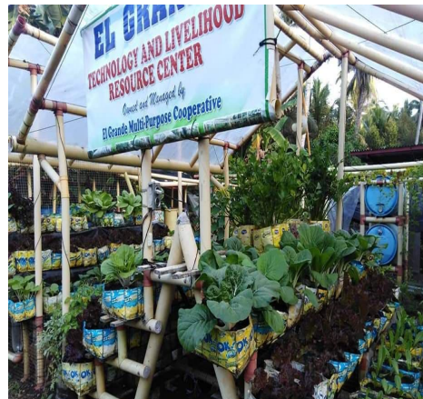
Technology and Livelihood Center of EMPC where seedlings of fruits and vegetables are grown