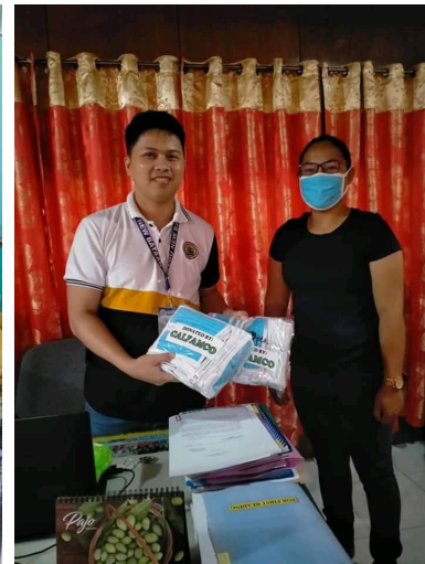
Face masks and relief goods distributed by CALFAMCO