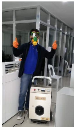
Sample application of Ozonation service (free of charge)