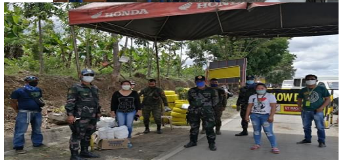
SARBAC distributing food packs to frontliners