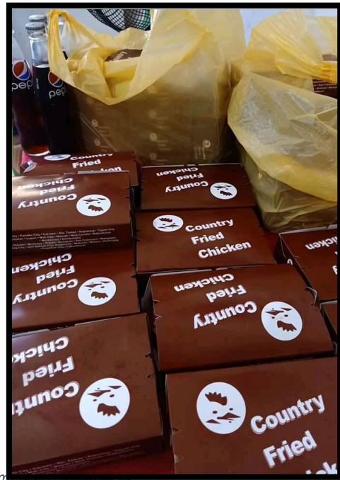
Katipunan Small Coconut Farmers Multipurpose Cooperative provided meals to frontliners