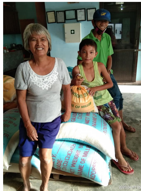
Mariphil MPC distributed rice to members