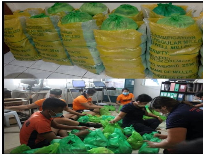
Distribution of Food Packs to the Less Fortunate Families (Fire Victims Last June 2019) at Market Site and Caramcam District, Mangagoy, Bislig City on April 12, 2020 A combined effort of 808th Squadron PCGA, PCG-Surigao del Sur and Makers Integrated Services Cooperative (MISC)

In view of the present crisis, the Management and Board of Directors of Surseco I Employee's Multipurpose Cooperative (SEMCO), motivated by compassion for its members, recognized the value of Barangay Electricians and Security Guards of SURSECO I. The cooperative distributed 10 kilos of rice and gave a 1-month moratorium in their loan obligations.