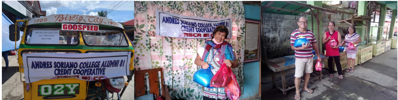
Andres Soriano College Akumni 81 Credit Cooperative (ASCAA81CC) distributed relief goods.

Food packs ready for distribution to 34 USEP/SDSSU Employees Contract of Service, Job Orders, Faculty Part-Timers, Security Guards, Cooperative Staff, and Frontliners.