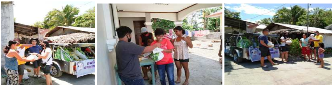
FVMPA distributed rice packs to 103 members in Barangay Baclig, Cabugao, Ilocos Sur