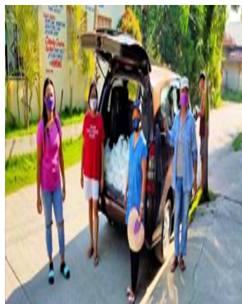
Women's Unity for Progress and Farmers MPC