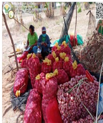
Pasuquin Onion Growers Agriculture Co

As we continue to struggle against COVID19, some 123 Savings and Credit Coops, Consumers Coops, Producers Coops, Marketing Coops and Multi Purpose Cooperatives with savings and credit operations, have opened, although on shortened operating hours, in order to provide the necessary services to members and communities during the ECQ, but at the same time observing social distancing of workers in the office.