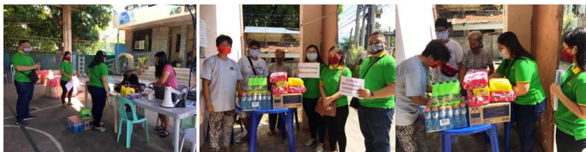
La Union MPC, Agoo, La Union distributed goods to the frontliners in Brgy. Camp One, Rosario, La Union