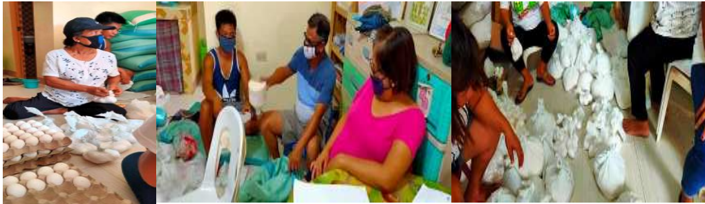
Womens Unity for Progress & FMPC. Repacking of relief goods.

Tubao Multipurpose Cooperative, Francia Sur, Tubao, La Union, 2nd wave for distribution of 2nd batch of rice relief to 18 Brgys of Tubao w/ 1,364 recipients, with 2.5 kgs. of rice for senior citizens, tricycle drivers, construction workers, pregnant women, PWD and to families with malnourished preschoolers.