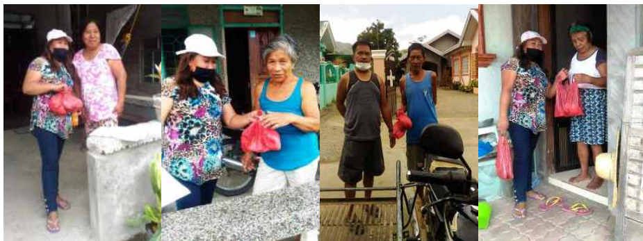
Hope of Lanao Consumers Cooperative in Bangui, Ilocos Norte distributed 126 kgs of pork for members and non-members worth P25,200.00