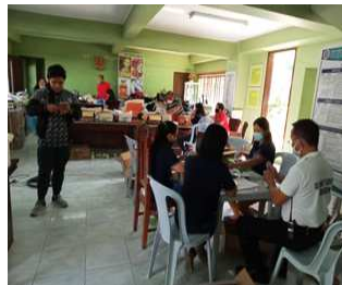
Women's Unity for Progress and Farmers MPC. Distribution of Relief goods

Suyo MPC Branch donated Php 50,000.00 to LGU