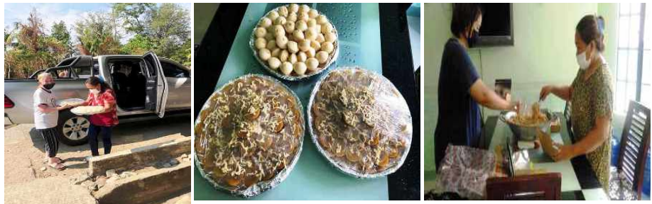
Hope of Lanao Consumers Cooperative, Bangui Ilocos Norte, distributed snacks to frontliners