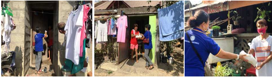
SACDECO provided food packs to some differently abled children of Sta. Cruz, Ilocos Sur