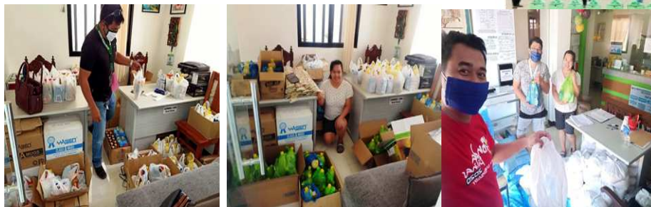
Suyo MPC, Vigan Branch Office, packing and distribution of relief goods to all members

FVMPC main branch distributed rice packages to regular members in Pantay Fatima, Daya and Laud