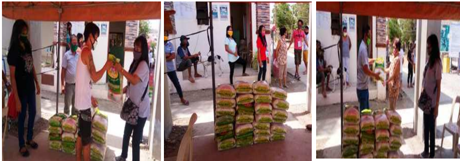
FVMPC distributed rice to 165 households in Shelterville, San Julian, Vigan City