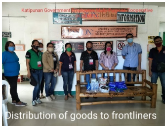
Distribution of goods to frontliners

Katipunan Government Employees Multi-Purpose Cooperative located at Katipunan Municipal Gymnasium, Katipunan, Zamboanga Del Norte, donated personal protective equipments such as raincoats and goggles, alcohol, vitamins, and food items like coffee and biscuits, to medical volunteers, PNP personnel, AFP personnel and MDRMMC Volunteers stationed at the municipal boundaries. The cost amounted to Php15,000.00