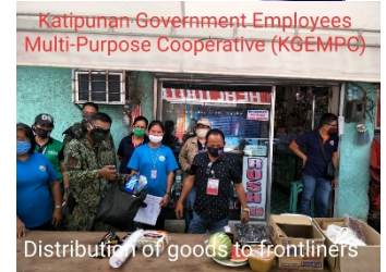
Distribution of goods to frontliners

which was charged against the coop's CDF.