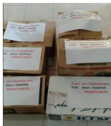
DFC Pawarb Multipurpose Cooperative (PAWARB COOP) donated goods

"Callawan Farmers Multipurpose Cooperative (CALFAMCO) in Cabinuangan, New Bataan, Davao de Oro provides 3 kilos of rice to their members."