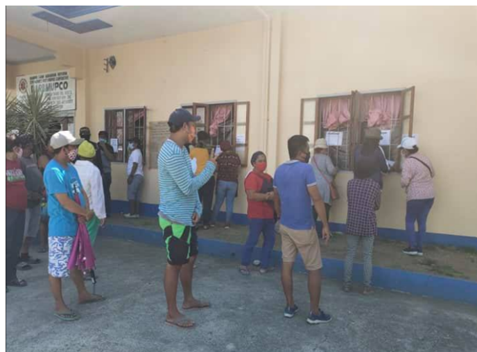
DIFCO distributing cash and relief goods while maintaining social distancing

Diamond Individual Farmers Cooperative (DIFCO) of Carmen, Davao del Norte, distributed cash and relief goods worth Php 200,000.00 on April 22, 2020 while in observation of social distancing.