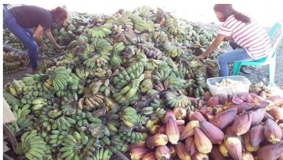
LBEARCO workers prepare cardaba banana hearts for donation

The Lapuy-Batallion Employees Agrarian Reform Beneficiaries Cooperative (LBEARBCO), a booming cardaba-based cooperative in Sitio Lapuy, Mandug, Davao City donated part of their current harvest to COVID-19 frontliners in Davao City.