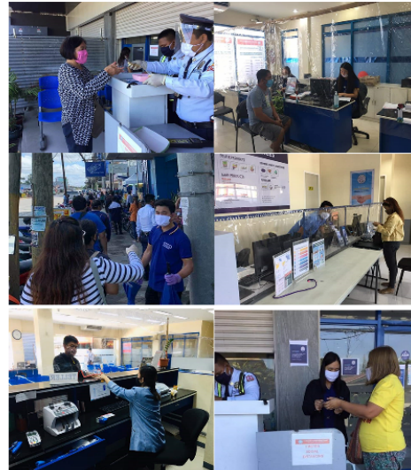
TC frontliners across all TC Branches continuously serve the transacting members during the release of Patronage Refund and Interest on Share Capital (PRISC) last April 1, 2020

All TC Branches continue to operate from 9:00am to 12:00nn Mondays to Fridays. Members are required to wear face masks, maintain at least one-meter physical distance and wash their hands upon entering and leaving TC premises. Disinfection of TC Offices are also being conducted regularly on places that are being accessed by members and employees.