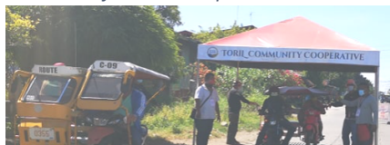
Tent provided for frontliners in Toril Checkpoints

Aside from the aforementioned practices, TCC has joined in the frontliners' fight against covid19 by donating PPEs to the hospitals in Toril Area amounting to Php67,000.00. The coop also responded to the call of MAGSIGE Coop to donate PPE to Southern Philippines Medical Center amounting to Php10,000.00, and provided Tents to frontliners assigned in the checkpoints in the Toril Area.