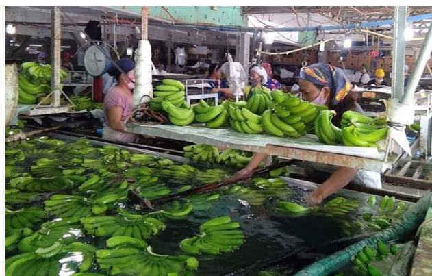
Beneficiaries of Agrarian Reform in checkered Multi-Purpose cooperative (BARC MPC)

"On the other hand, Katipunan Small Coconut Farmers Multi-Purpose Cooperative , also in Panabo City, have also extended their assistance to the frontliners in the city by giving them food packs, water and alcohol."