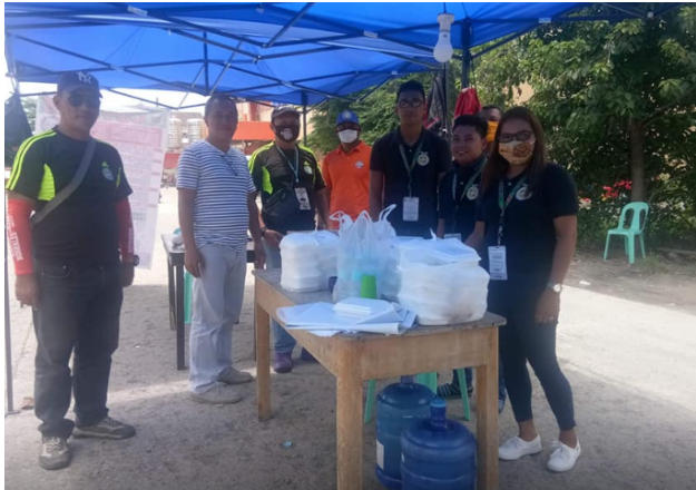
Photo credits to Ms. Leny Tomas Rosas. The pictures were posted in Registered Cooperatives in Davao Oriental social media page on April 16, 2020.

Limbahan Small Coconut Farmers and Women Multipurpose Cooperative (LIMSCOFARMCO) gave foodpacks to volunteers and frontliners. They also distributed relief goods.