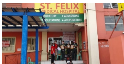
Donation of PPEs to hospitals in Toril area