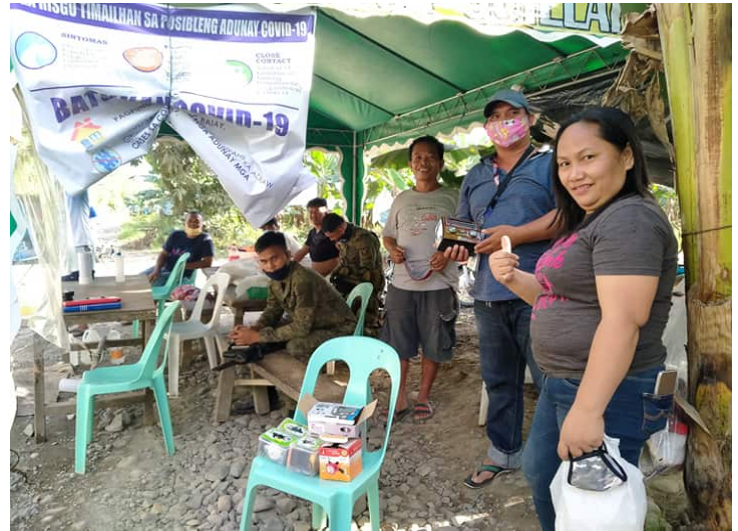
PAFAMUPCO donated headlamps/flashlights and radio to Baclog Post COVID-19 Brgy. Task Force