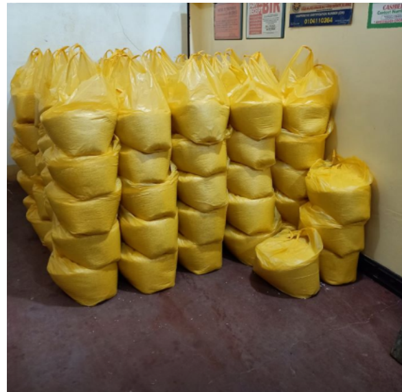
NIA-SEIMCO distributed relief goods to its members