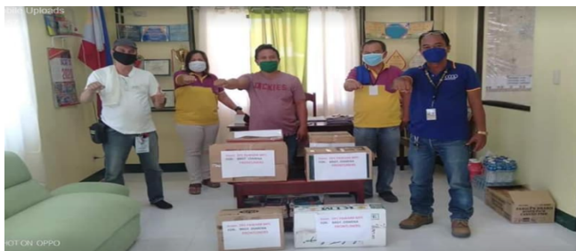
Callawan Farmers Multipurpose Cooperative (CALFAMCO)

"Callawan Farmers Multipurpose Cooperative (CALFAMCO) in Cabinuangan, New Bataan, Davao de Oro provides 3 kilos of rice to their members."