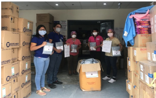
MAGSIGE MPC staff purchased food packs and PPEs to deliver to frontliners