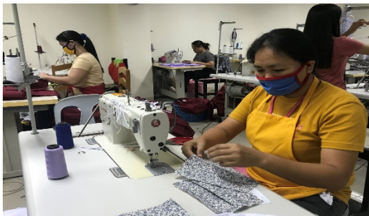
PPEs and facemasks are being sewn in their workplace for distribution to frontliners

Manuel Guianga and Sirib Growers and Employees Multipurpose Cooperative (MAGSIGE MPC) initiated the following activities in their fight against the current pandemic: