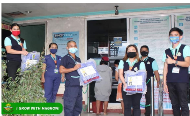
Maragusan Growers Multipurpose Cooperative (MAGROW MPC)

"Imbued by the spirit of bayanihan, DFC PAWARB MPC of Compostela, MAGROW MPC of Maragusan, and CALFAMCO of New Bataan, take part in donating PPEs to the frontliners and medical workers of their respective municipalities."