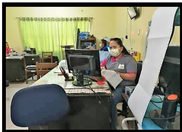
DAPCO Agrarian Reform Beneficiaries Cooperative (DARBCO)

"Also in the Panabo City, operations in DAPCO Agrarian Reform Beneficiaries Cooperative (DARBCO) and Beneficiaries of Agrarian Reform in checkered Multi-Purpose cooperative (BARC MPC) have also been continuing amidst the scare of the pandemic in order to continue the supply of much needed cavendish banana in the market as well as to help its members and constituents. Selected but essential workers in the cooperative were called to report in the plants to assist the production of cavendish banana."