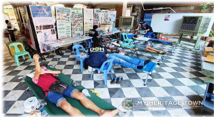
GOESEN MPC conducted a blood donation program.