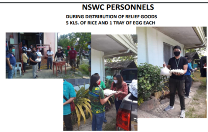
FOR THE FRONTLINERS