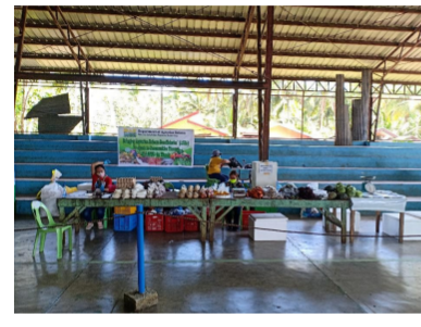
They did the same on April 24, 2020 at Baguio District, Davao City.