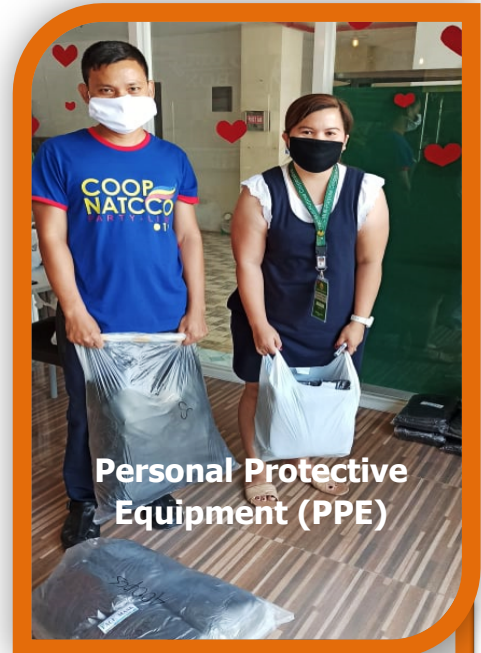
Personal Protective Equipment (PPE)