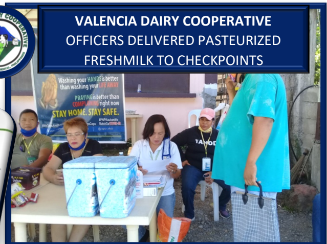
VALENCIA DAIRY COOPERATIVE OFFICERS DELIVERED PASTEURIZED FRESHMILK TO CHECKPOINTS