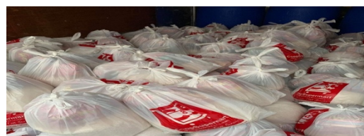
Food packs to the poorest of the poor in Bacolod City