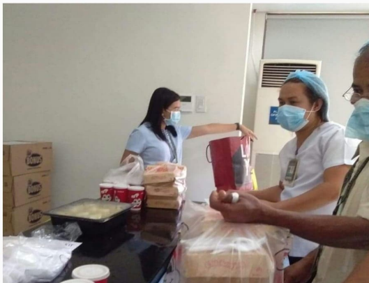
Negros Consolidated Farmers Multi-Purpose Cooperative's Assistance