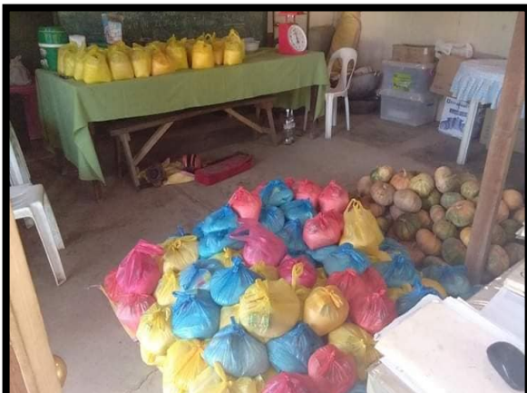
CARC food packs ready for distribution

Occidental. It was organized by the Department of Agrarian Reform on April 4, 1994. The cooperative was registered with the Cooperative Development Authority (CDA) on September 30, 2010 with Registration Number 9520-06016711. They have 110 Agrarian Reform Beneficiaries.