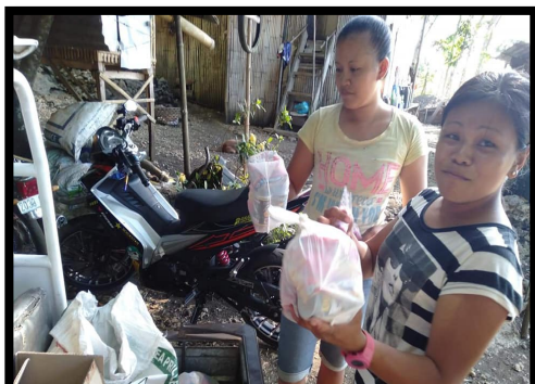
Crossing Ibos Farmers Credit Cooperative (CIFCC) 2 nd Batch of Food

CIFCC is a recipient of several projects and programs of the Department of Agrarian Reform (DAR), Negros Occidental II (South) together with other government and non-government agencies.