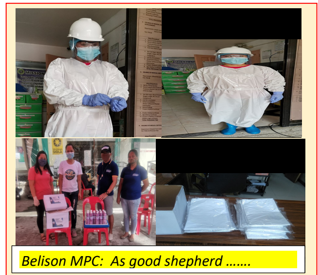
Belison MPC: As good shepherd .....