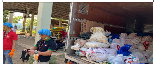
2 nd Wave of Assistance to the Beneficiaries