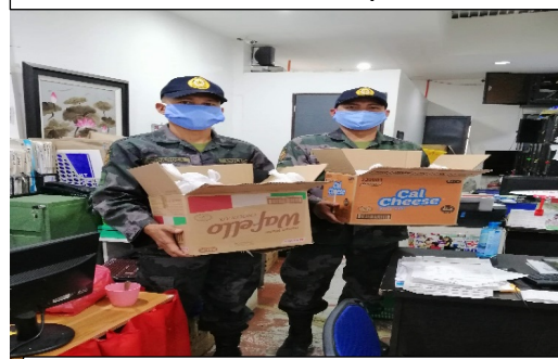
Meals, Alcohol and Face Masks for

The Board of Directors approved a total amount of Six Hundred Sixty Thousand Five Hundred Pesos (Php 660,500.00) from the Community Development Fund (CDF) to be used as financial assistance to the community.