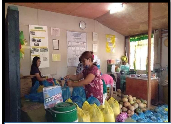
CARC Personnel Repacking the food packs for assistance- Pontevedra, Negros Occ.

Casal-agan Agrarian Reform Cooperative (CARC) is situated at Barangay Antipolo, Pontevedra, Negros