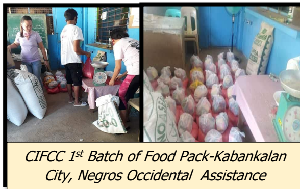
CIFCC 1 st Batch of Food Pack-Kabankalan City, Negros Occidental Assistance