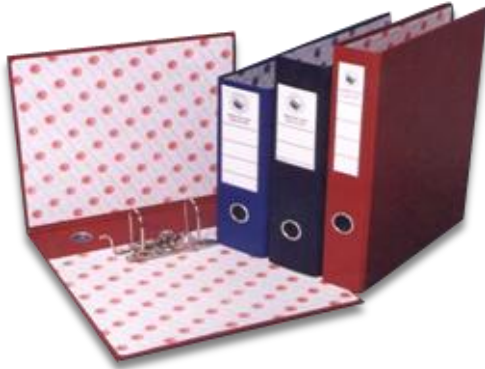
Lever Arch Binder