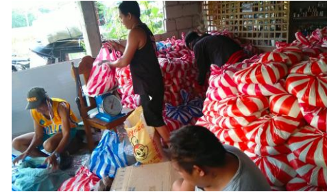
G-125 Golden PMPC Tarlac