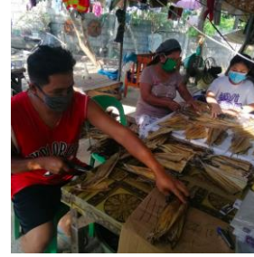
PASCOOP La Union