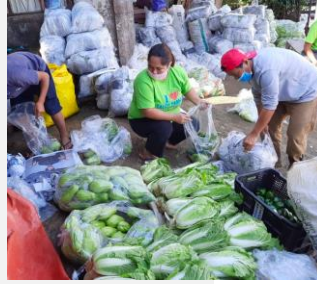
Taloy Norte MPC Benguet