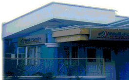
integrated Primary & Maternity Health Care Services