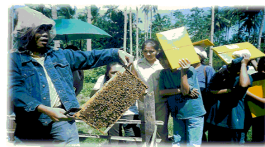
ARB's Women Beekeeping Livelihood Project