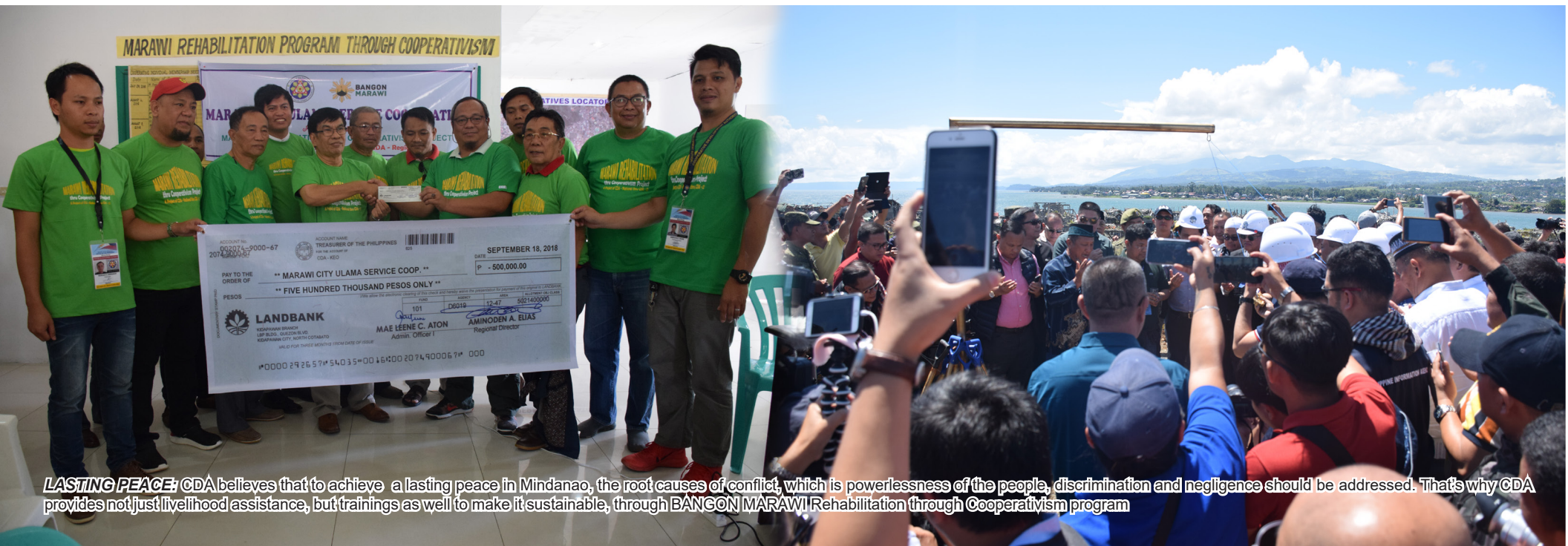
LASTING PEACE: CDA believes that to achieve a lasting peace in Mindanao, the root causes of conflict, which is powerlessness of the people, discrimination and negligence should be addressed. That's why CDA provides not just livelihood assistance, but trainings as well to make it sustainable, through BANGON MARAWI Rehabilitation through Cooperativism program