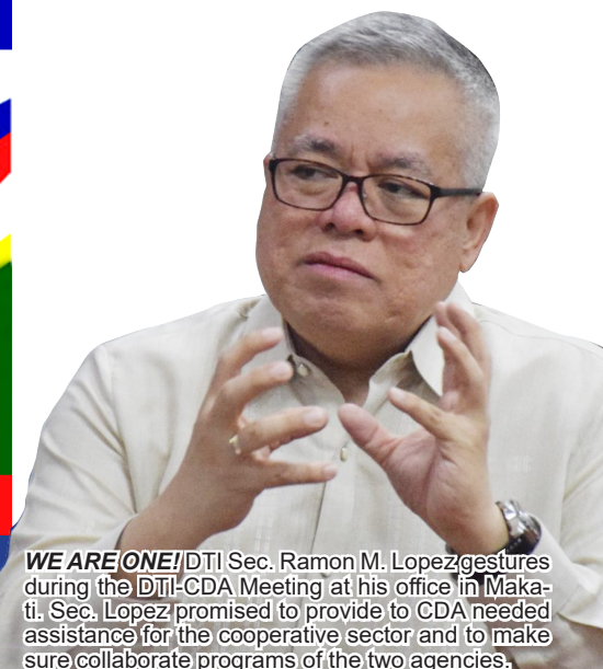
WE ARE ONE! DTI Sec. Ramon M. Lopez gestures during the DTI-CDA Meeting at his office in Makati. Sec. Lopez promised to provide to CDA needed assistance for the cooperative sector and to make sure collaborate programs of the two agencies.