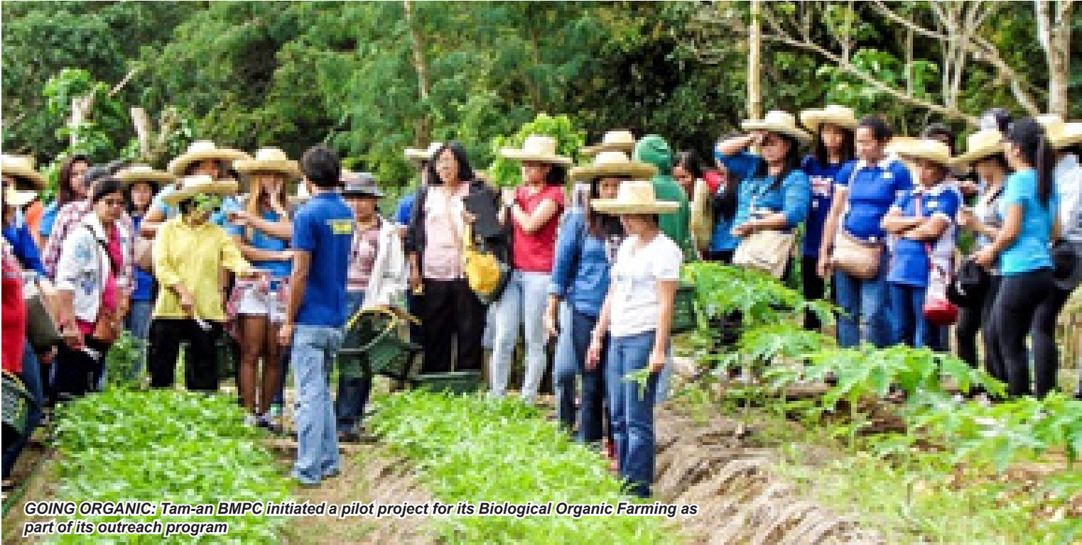
GOING ORGANIC: Tam-an BMPC initiated a pilot project for its Biological Organic Farming as part of its outreach program