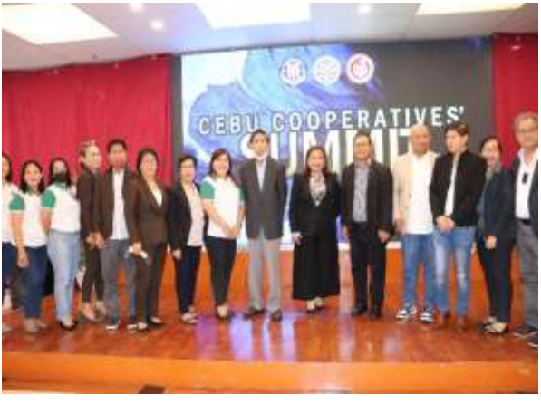
CDA Officials and Coop Bank of Cebu Officers

The Cebu Cooperatives' Summit is a reflection of partnerships and sharing of resources for the benefit of the cooperative sector and the community it serves.