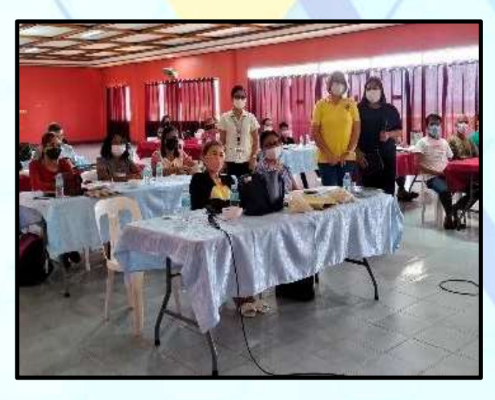
March 1, 2022 | Organization Of The Feedstocks Palm Oil Producers Federation Of Cooperatives (FPOP FC). The objective of convening the Palm Oil Producers Cooperatives is to organize a federation that would take care of the palm oil cooperatives in the province of Palawan. Attended by 13 participants from 5 cooperatives.