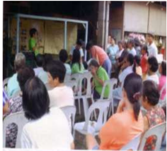
Orientation on Solid Waste Mgt.

International Trainings and Seminars Saemaul Leadership Training Program, Department of Saemaul Studies and Economic Development, Enderun Colleges and the Institute for International Development Cooperation, Yeungnam University, Republic of Korea September 13 – 19, 2015