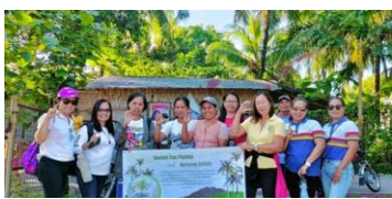
Tigmamale Agrarian Reform Cooperative

Each cooperative was given 100 pieces of seedlings of dwarf coconut trees, a total of 500 pieces were provided by the PCA as planting materials to be planted in the planting site of the cooperative in the same barangay.